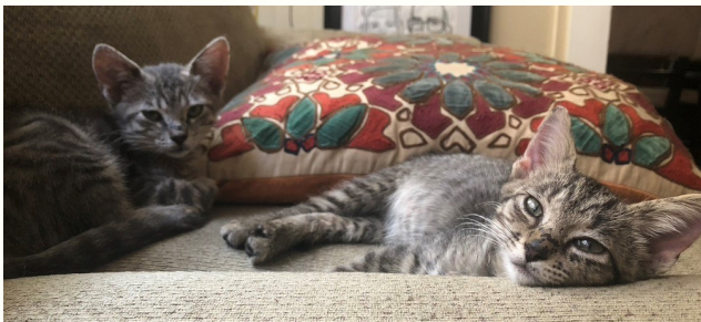
Mario and Luigi in their new home