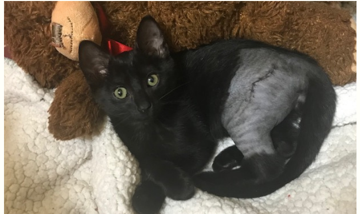
Little Fred had to have a leg pinned, but ended up with an inside home in the deal!